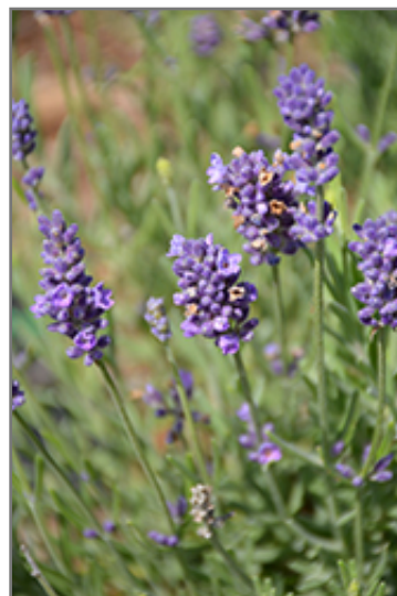
Ellagance Purple Lavender flowers

Ellagance Purple Lavender is recommended for the following landscape applications;