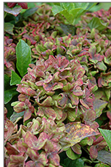
Pistachio Hydrangea flowers