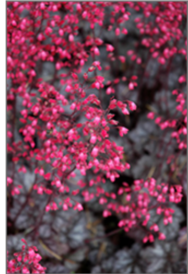
Glitter Coral Bells flowers

Glitter Coral Bells is a fine choice for the garden, but it is also a good selection for planting in outdoor pots and containers. It is often used as a 'filler' in the 'spiller-thriller-filler' container combination, providing a mass of flowers and foliage against which the larger thriller plants stand out. Note that when growing plants in outdoor containers and baskets, they may require more frequent waterings than they would in the yard or garden.