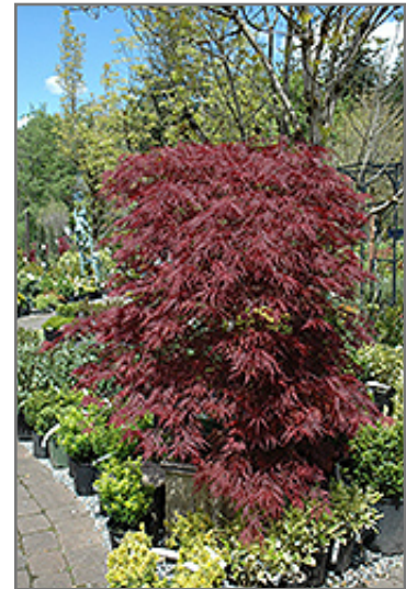
Red Dragon Japanese Maple

Red Dragon Japanese Maple is a fine choice for the yard, but it is also a good selection for planting in outdoor pots and containers. Because of its height, it is often used as a 'thriller' in the 'spiller-thriller-filler' container combination; plant it near the center of the pot, surrounded by smaller plants and those that spill over the edges. It is even sizeable enough that it can be grown alone in a suitable container. Note that when grown in a container, it may not perform exactly as indicated on the tag - this is to be expected. Also note that when growing plants in outdoor containers and baskets, they may require more frequent waterings than they would in the yard or garden. Be aware that in our climate, this plant may be too tender to survive the winter if left outdoors in a container. Contact our experts for more information on how to protect it over the winter months.