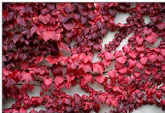
Veitch Boston Ivy in fall