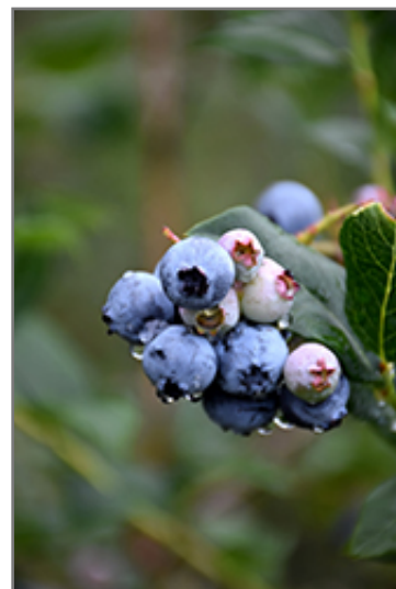
Chippewa Blueberry fruit

Chippewa Blueberry features dainty clusters of white bell-shaped flowers with shell pink overtones hanging below the branches in mid spring. It has green deciduous foliage. The glossy oval leaves turn an outstanding orange in the fall. It features an abundance of magnificent blue berries in mid summer.