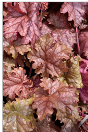
Carnival Peach Parfait Coral Bells foliage

Carnival Peach Parfait Coral Bells is recommended for the following landscape applications;