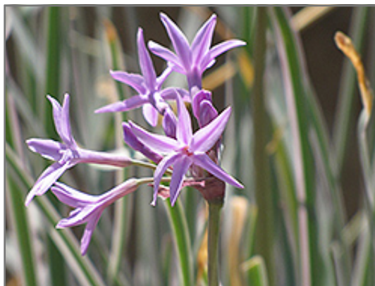
Variegated Society Garlic flowers