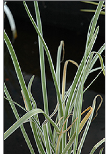
Variegated Society Garlic foliage

This plant is quite ornamental as well as edible, and is as much at home in a landscape or flower garden as it is in a designated herb garden. It does best in full sun to partial shade. It prefers to grow in moist to wet soil, and will even tolerate some standing water. It is not particular as to soil type or pH. It is somewhat tolerant of urban pollution. This is a selected variety of a species not originally from North America. It can be propagated by division; however, as a cultivated variety, be aware that it may be subject to certain restrictions or prohibitions on propagation.