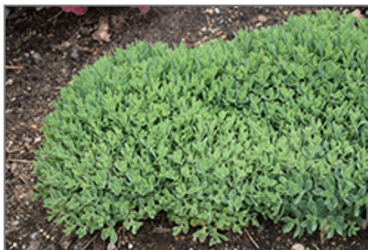
Rock 'N Round Pure Joy Stonecrop

Rock 'N Round Pure Joy Stonecrop is a fine choice for the garden, but it is also a good selection for planting in outdoor pots and containers. It is often used as a 'filler' in the 'spiller-thriller-filler' container combination, providing a mass of flowers and foliage against which the thriller plants stand out. Note that when growing plants in outdoor containers and baskets, they may require more frequent waterings than they would in the yard or garden.