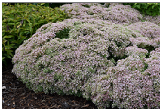
Rock 'N Round Pure Joy Stonecrop in bloom

This is a relatively low maintenance plant, and is best cleaned up in early spring before it resumes active growth for the season. It is a good choice for attracting bees and butterflies to your yard, but is not particularly attractive to deer who tend to leave it alone in favor of tastier treats. It has no significant negative characteristics.