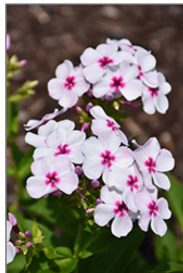
Flame White Eye Garden Phlox flowers

Flame White Eye Garden Phlox is a fine choice for the garden, but it is also a good selection for planting in outdoor pots and containers. With its upright habit of growth, it is best suited for use as a 'thriller' in the 'spiller-thriller-filler' container combination; plant it near the center of the pot, surrounded by smaller plants and those that spill over the edges. Note that when growing plants in outdoor containers and baskets, they may require more frequent waterings than they would in the yard or garden.