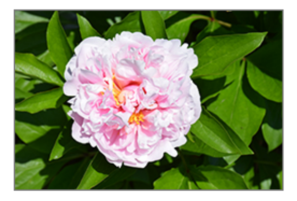
Tourangelle Peony flowers