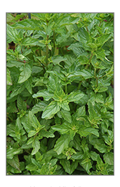
Margarita Mint foliage

Aside from its primary use as an edible, Margarita Mint is sutiable for the following landscape applications;