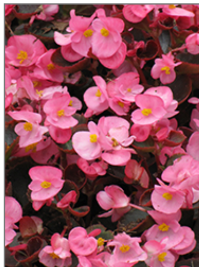
Bada Boom Pink Begonia flowers