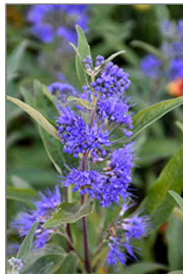
Sapphire Surf Caryopteris flowers

Sapphire Surf Caryopteris is recommended for the following landscape applications;