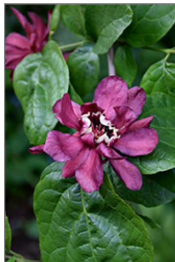
Hartlage Wine Sweetshrub flowers