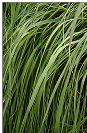
Red Bunny Tails Fountain Grass foliage